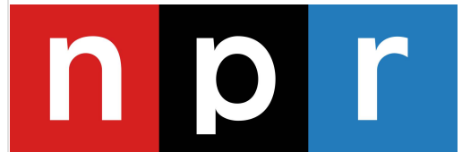
Logo of NPR, National Public Radio